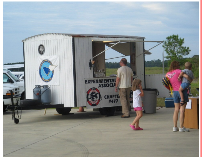
Chapter 477's Mobile Canteen