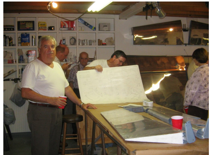
Don's Dad in front of the RV-8 elevators

For the latest information go to www.eaa477.org