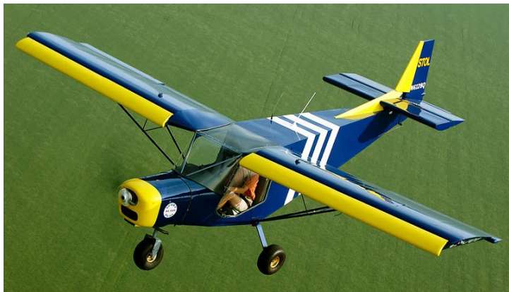
Zenith Factory Demonstrator